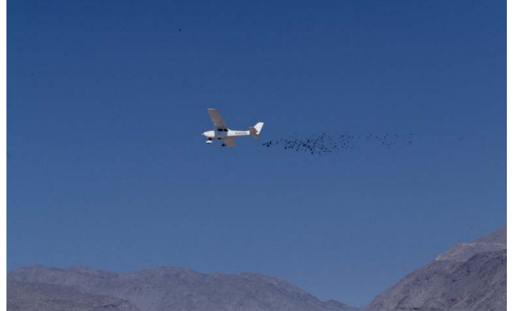
Above: Black Propaganda at Melancholy Ranch , 2003, action performed and filmed in Southern Californian Desert; below: The Ritualised Death of the International Mural Artist (designs for ceremony, parade and burial of sacrificed artist on east London Estate), 2004; left: When Devolved Power Enters the Fourth Dimension , 2007, n°1 from the advanced graffiti series - fly poster and painted sign

NO MAN AMONGST YOU IS FIT TO JUDGE... ...THE MIGHTY ART THAT I HAVE WROUGHT. YOUR RITUALS ARE EMPTY OATHS YOU NEITHER UNDERSTAND OR LIVE BY. I AM DEMOCRACY!