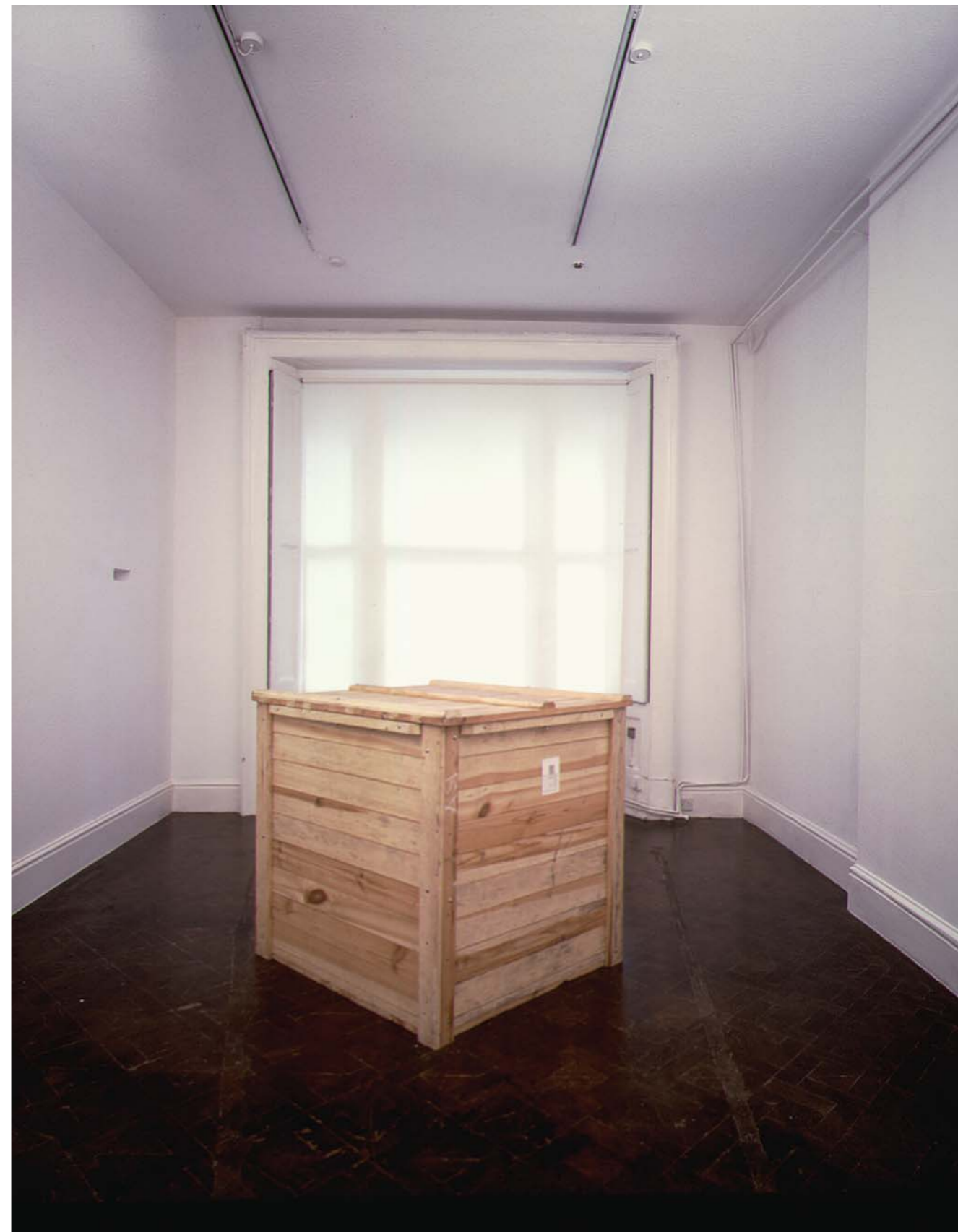
Above: 500 pounds of Common earth, June 2000-Aug 2003, 1 Metre Cubed, Transylvania to Los Angeles, (Crated earth installed in gallery of the Austrian Cultural Foundation, London); left: 500 Pounds Of Common Earth, (Share Certificate - Dublin Share issue)